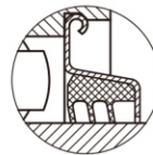
L 3 Triple-lip seal (Optional)